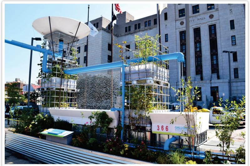
A demonstration/exhibit on Roosevelt Plaza, in front of Camden’s City Hall.

Additional partnership efforts by the city include: working with the U.S. EPA to develop a “green infrastructure handbook” that is provided to local businesses, utilizing the services of the Trust for Public Land to help identify appropriate sites for green infrastructure, engaging the Nature Conservancy to undertake a study of vacant parcels for their potential to manage stormwater, working with the Pennsylvania Horticultural Society to develop a rain barrel program, and utilizing the guidance offered by the Philadelphia Water Department to develop water resource management programs and initiatives. Capitalizing on the desire to achieve multiple project benefits, the city, along with CCMUA and Center for Family Services, a non-profit, created a job-training program to train young people in landscape management, park maintenance, and green infrastructure maintenance. This program not only provides job training for work related to the city’s park, water resources, and land management projects, but also assists with job placement, a critical component of any job-training program.