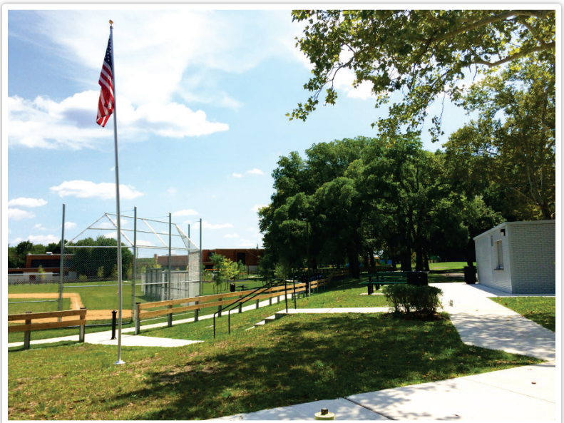
Von Neida Park is a facility that benefited from daylighting Baldwin’s Run, which is immediately adjacent to the active recreation site.

The Camden SMART Initiative, a working group within CCI, developed a multi-pronged approach to address the city’s stormwater management challenges, including: (1) implementing a water conservation ordinance to reduce usage; (2) undertaking green infrastructure projects; (3) cleaning and