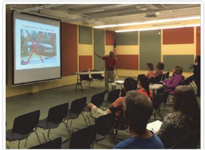
Rain garden training session.

Between 2015 and 2016, the township provided rain garden information to 45 residents, and RCE developed conceptual designs for 12 properties from that group of attendees.