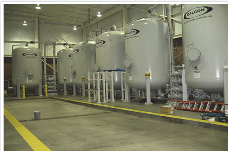
A series of granular activated carbon filtration tanks used to treat contaminated groundwater in Warrington Township.

The primary source of outside technical assistance the township receives is from PADEP. The township believes PADEP has been very helpful in providing guidance throughout this process, although at times the township has found their assistance to be highly technical and not easily decipherable by township staff or residents. This has contributed to some uneasiness.