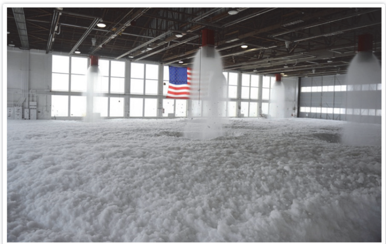
This photo shows a system that is distributing fire-fighting foam in a military hangar.

Unifying issues: Aquifer contamination and the inability of action by regulatory agencies led to municipal involvement and subsequent action.