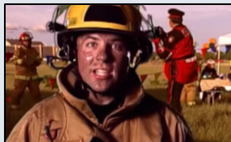
"It's No Picnic Out Here"