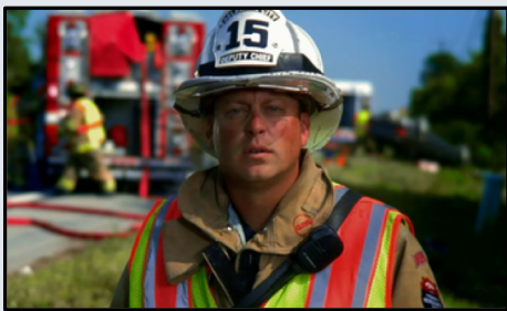
"Slow Down Move Over"