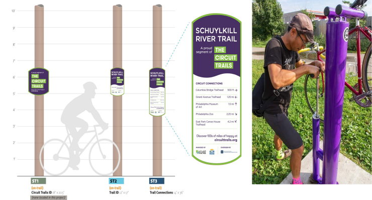
Bicycle fix-it station design and in-person at RiverLine Stations via Tri-State Campaign TOP grant