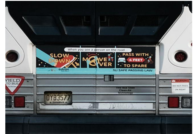
Safe Passing Law advertising campaign on NJT buses via Tri-State Campaign TOP grant