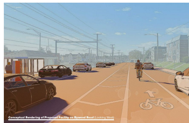
Conceptual rendering of a proposed facility from the Eastern DelCo Bikeway Prioritization Study