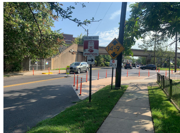
Cross County Connection TMA Outreach and Education Project