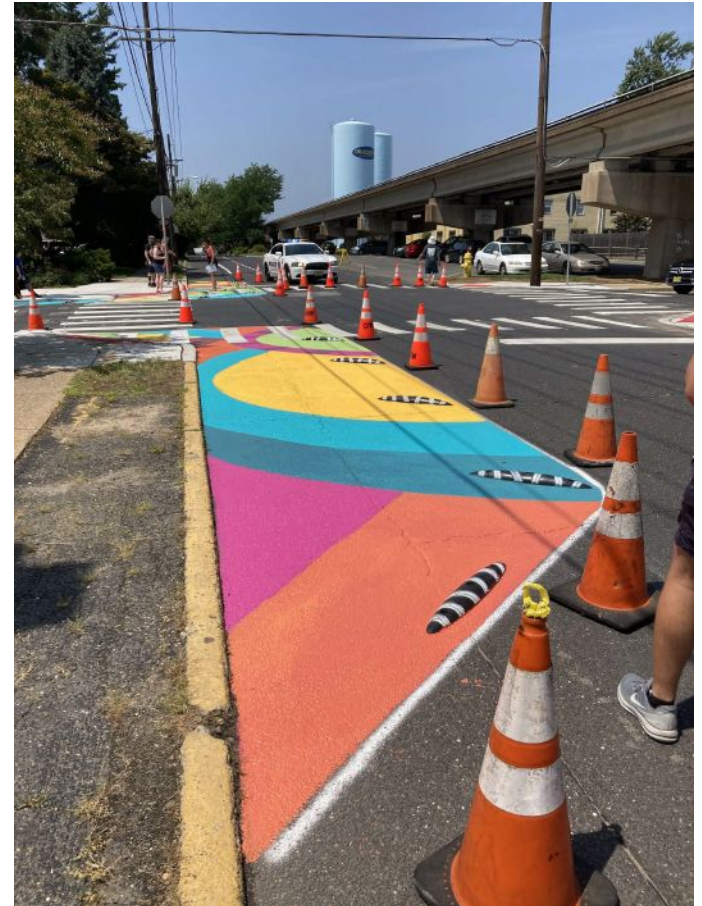
Cross County Connection TMA Outreach and Education Project