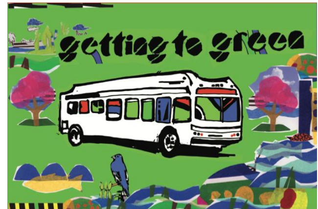
Getting to Green mural created by Mural Arts for advertising the project