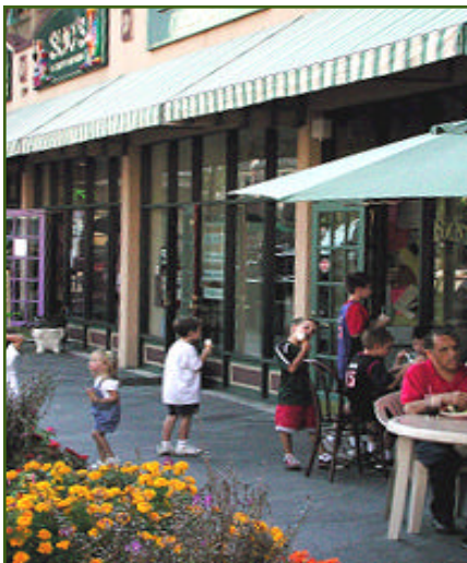
Transit- and pedestrian-friendly development in South Orange Village, NJ.

After a few years of low-level interest, the burgeoning real estate market and growing congestion provided a “wake-up call” to developers and municipalities, who started contacting NJ TRANSIT for more help. The response was to obtain federal funding (a Transportation and Community and System Preservation Grant) for technical assistance. Partners with NJ TRANSIT included New Jersey Futures, the Regional Plan Association, the Project for Public