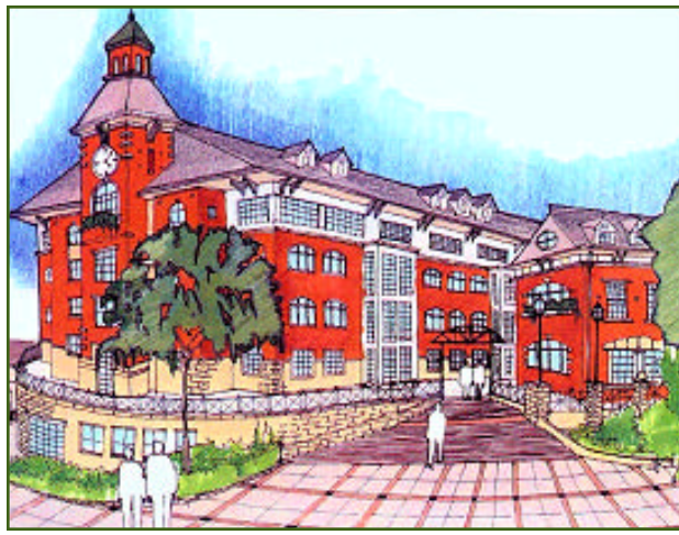
Artist's rendering of a transit-friendly development near the Morristown NJ TRANSIT station.