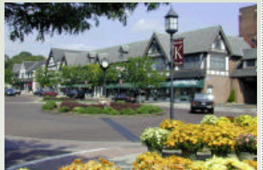
Before (top) and after (bottom) improvements.

The study prompted Cheltenham to approach SEPTA regarding the construction of a mixed-use parking structure. Following a determination of parking demand, SEPTA has agreed. Now, the Township, Montgomery County and SEPTA are each contributing to a $45,000 feasibility assessment to determine the actual size, operation, retail mix, management entity and funding for the facility, with the intention of pursuing federal dollars.