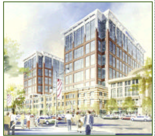
The BellSouth business center at Lindbergh.

Each of the business center sites – Lenox Park, Midtown and Lindbergh Center – presented a different context and various challenges. The Lenox site is furthest along, with both buildings complete and occupied. Located a mile away from the train station, the Lenox site presented the greatest challenge to creating a transit- and pedestrian-friendly environment, as employees are not likely to walk to MARTA or nearby businesses. Thus, BellSouth and area businesses plan to operate a shuttle.