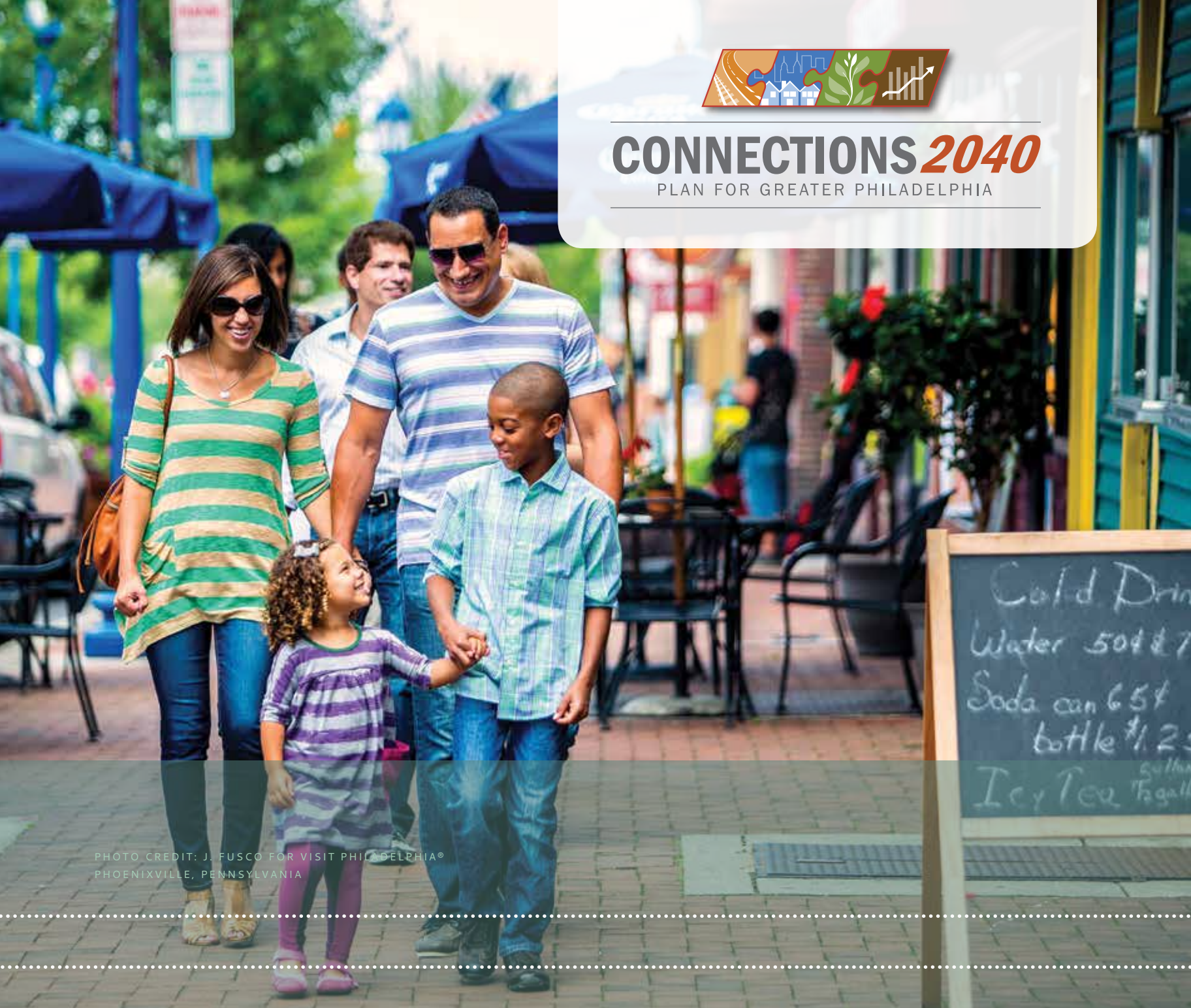
PHOENIXVILLE, PENNSYLVANIA

Between now and 2040, we anticipate over 600,000 additional people and 300,000 additional jobs in our region. Where those people live, what kind of work they do, and how they travel between work and home will define our future.