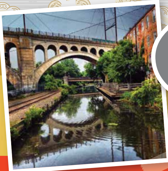
QUOTE & PHOTOS: andres vivanco