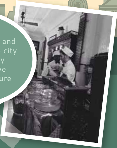
QUOTES & PHOTOS: maria bravo

"One day there's white tree branches and a few days later, the city looks like a cherry painting. I also love the city's architecture and parks."