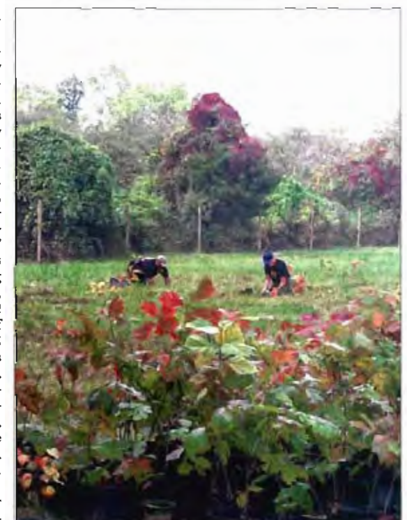
MERCER COUNTY WILDLIFF CENTER

Baldpate Mountain, together with adjacent woodlands, coinprises by far the largest forest in Mercer County and is part of the 90-square-mile Sourland