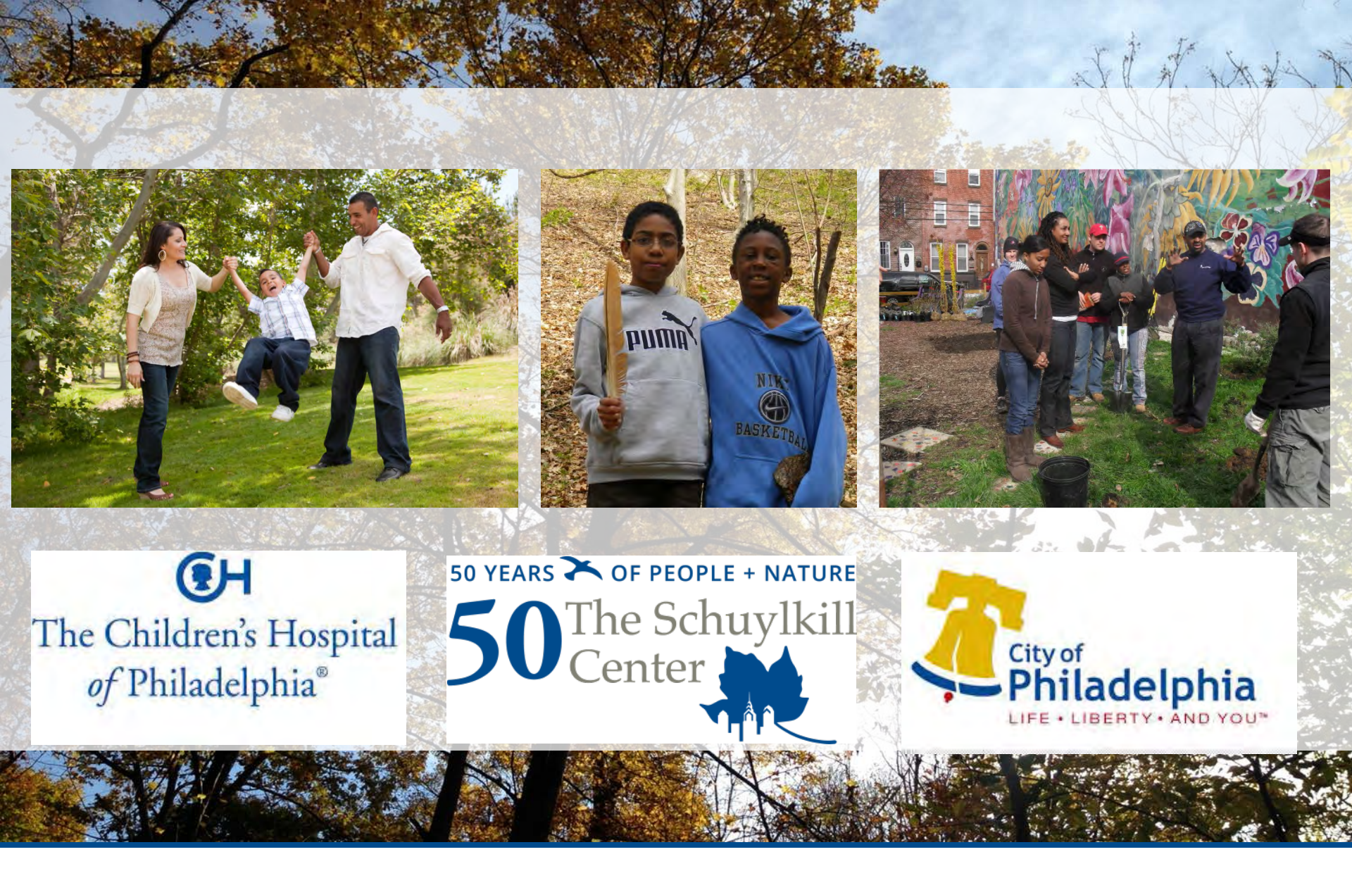
Nature Rx: Go Out and Play