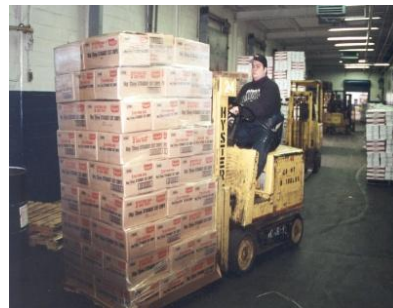
Domestic Warehousing (if necessary)