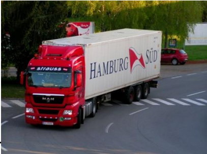
Overseas Trucking to Port