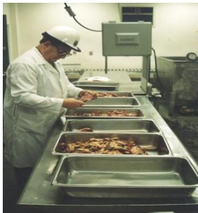
U.S. Regulatory Inspections (if necessary)