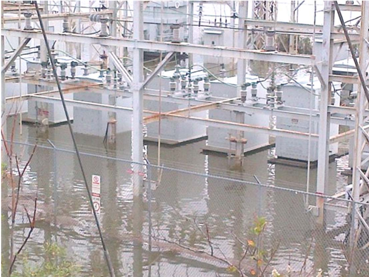
Substation Under Water