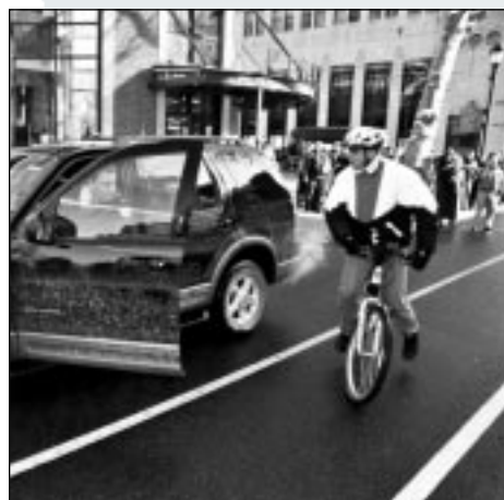
— University of Pennsylvania police officers demonstrate a typical bicycle-motorist accident.