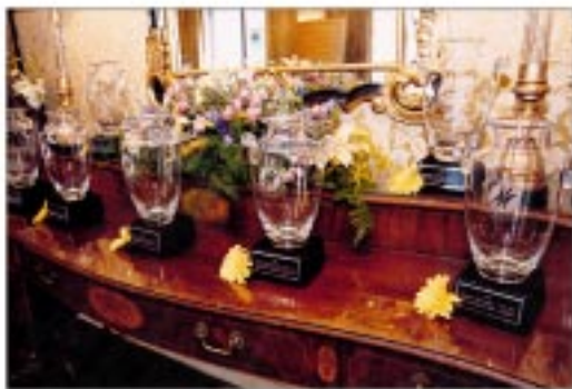
And the award goes to... Crystal vases served as awards in six specially selected categories.