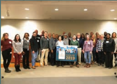
DVRPC welcomed the 2019 cohort of Public Participation Task Force members.

DVRPC's committees advise the Board on specific regional issues while ensuring that interested parties, including member governments, subject matter experts, and concerned citizens, have an opportunity to participate in the planning process.