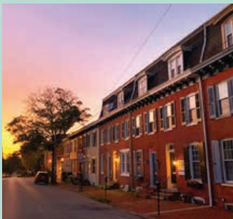
Media, PA

DVRPC manages three unique programs that invest in making the region a better place by educating people on their walkable communities, air quality, and transportation options.