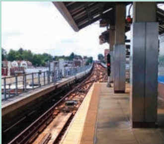
Frankford Transportation Center, Philadelphia, PA