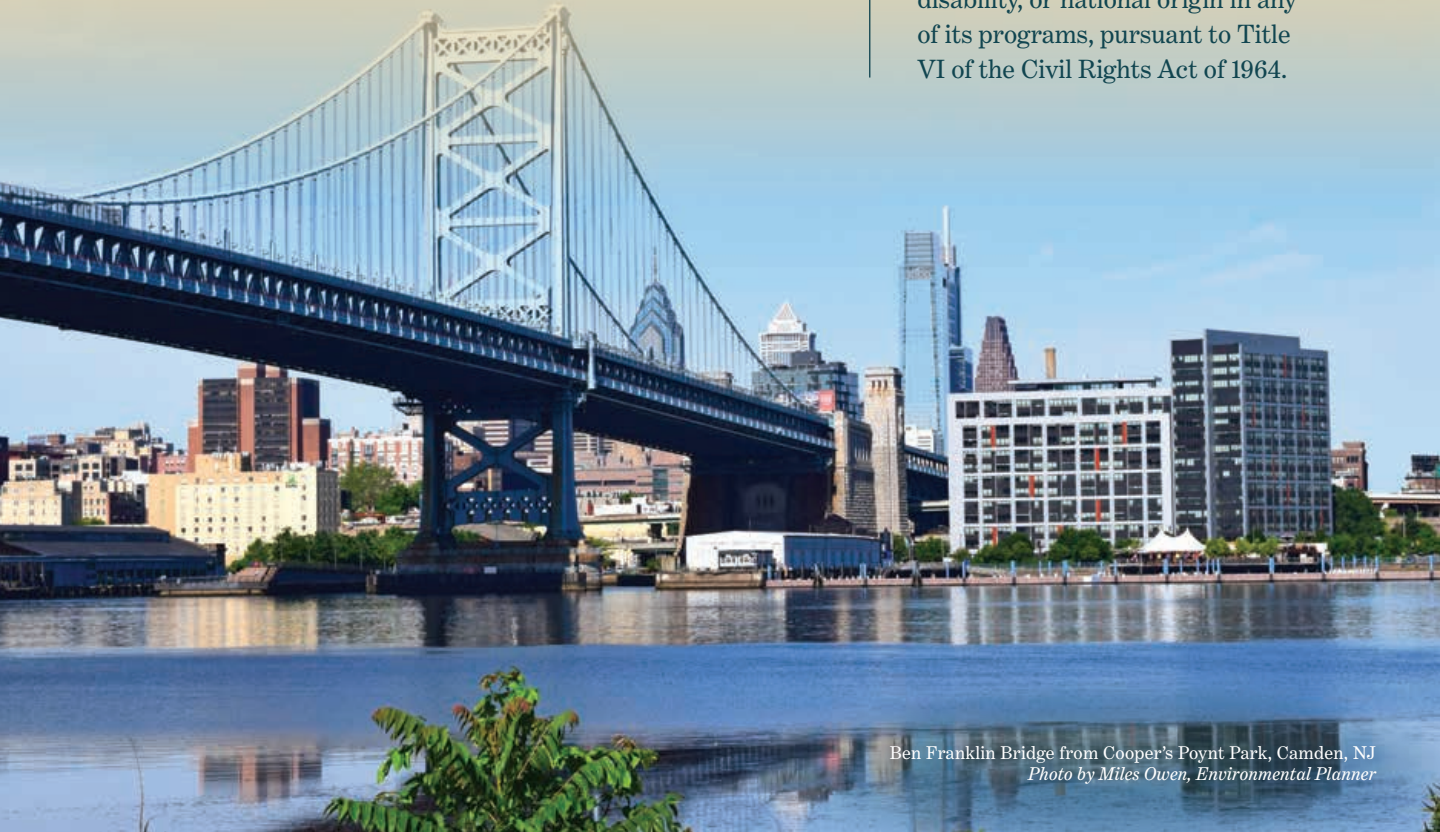
Ben Franklin Bridge from Cooper's Poynt Park, Camden, NJ

DVRPC does not discriminate based on race, color, age, sex, disability, or national origin in any of its programs, pursuant to Title VI of the Civil Rights Act of 1964.