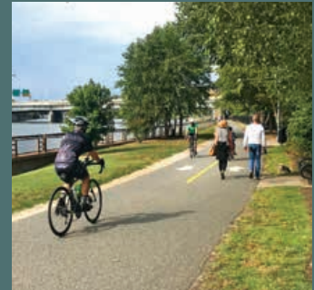
Schuylkill River Trail, Philadelphia, PA

TO LEARN MORE, VISIT WWW.DVRPC.ORG/TRANSPORTATION/MODELING .