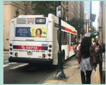
SEPTA Bus in Center City, Philadelphia, PA

VISIT WWW.AIRQUALITYPARTNERSHIP.ORG FOR DAILY AIR QUALITY FORECASTS AND RESOURCES.