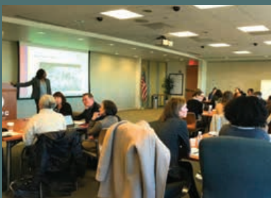
Healthy Communities Task Force members participated in a series of workshops on diversity, inclusion, and equity.