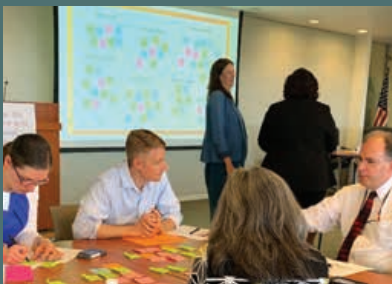
The Regional Community & Economic Development Forum partnered with Temple University to address turnover in the transit industry.