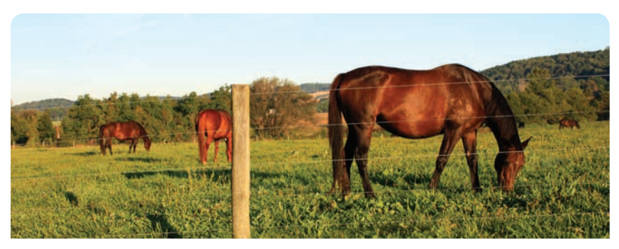
Horses in Douglass, PA

Eat Local Montco: Montgomery County's Local Food Promotion Strategy seeks to strengthen county farms, bolster the health and quality of life of county residents, and implement the county's comprehensive plan, Montco 2040: A Shared Vision, by promoting local food to county residents, institutions, and businesses. It analyzes the county's current agricultural and food system resources, acknowledging the challenges of local food production, distribution, and marketing, while at the same time making recommendations to strengthen local farms by linking local producers with local buyers, consumers, restaurants, and institutions.