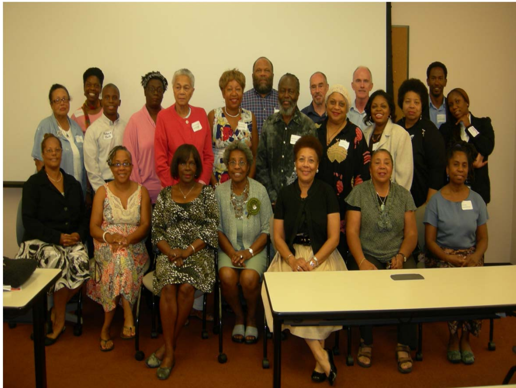
Leaders from five of Philly's Historic sites attended the two-day intensive; Most are also part of AAHTP.