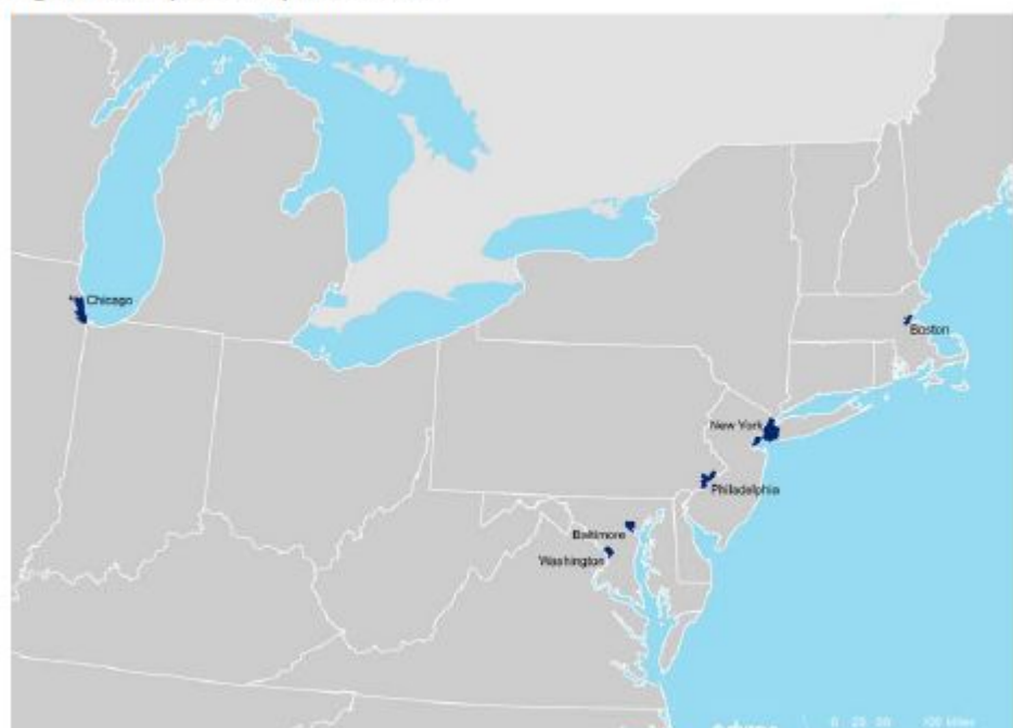
Figure 2. Map of Comparison Cities