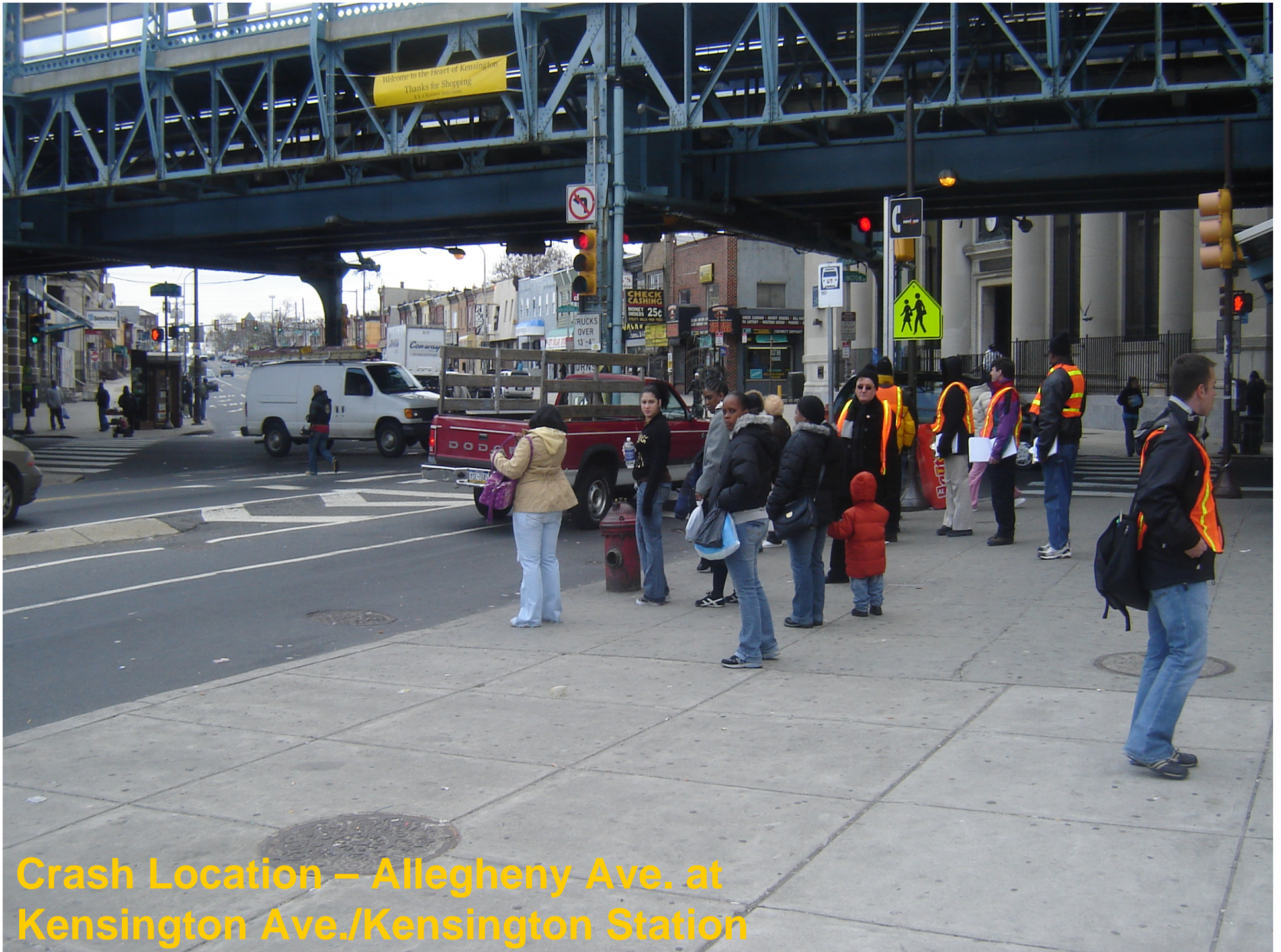
Crash Location – Allegheny Ave. at Kensington Ave./Kensington Station