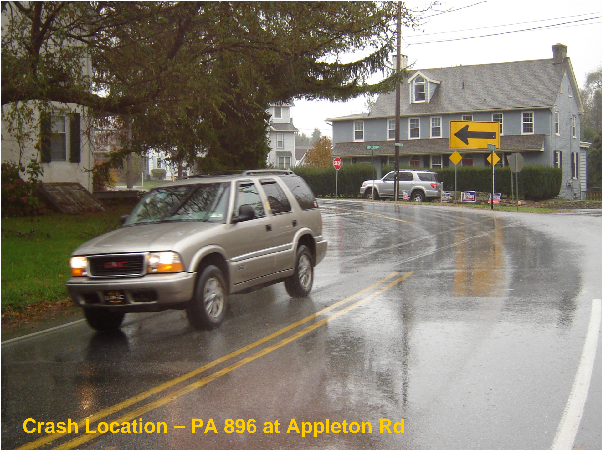
Crash Location – PA 896 at Appleton Rd