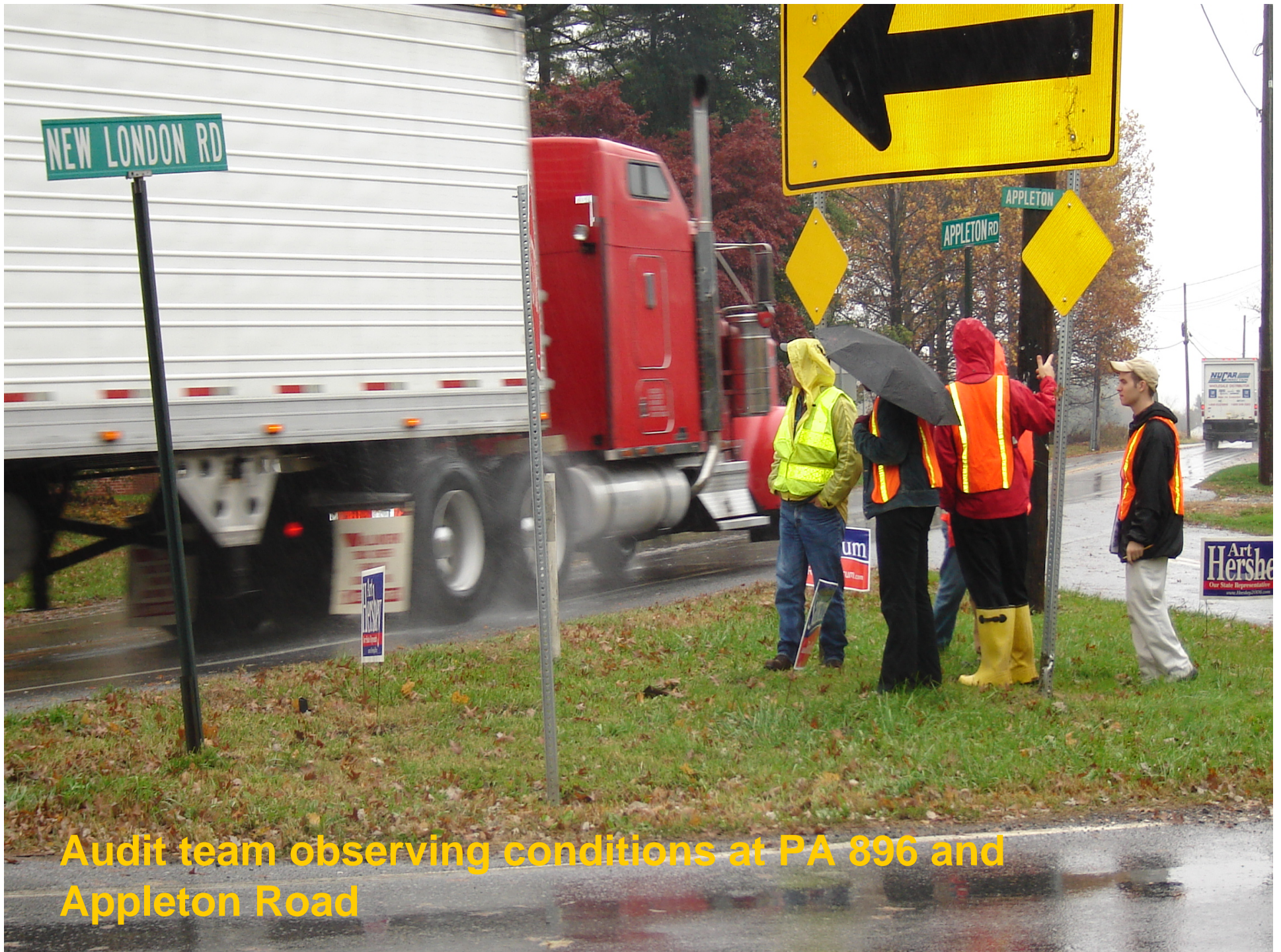
Audit team observing conditions at PA 896 and Appleton Road