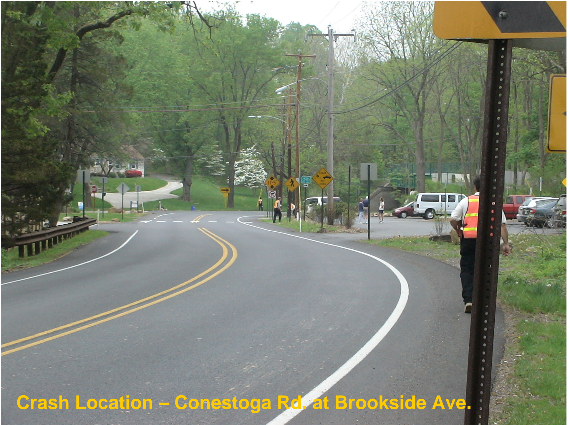
Crash Location – Conestoga Rd. at Brookside Ave.