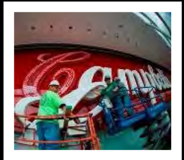
April 26, 2010 The iconic Campbell "C" is installed