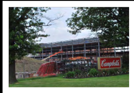
Throughout 2009 Construction crews worked daily to build the structure