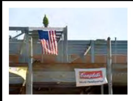
April 24, 2009 A traditional "topping off" ceremony was held