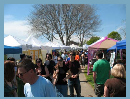
Crowds enjoy Shad Fest at Penn Treaty Park.