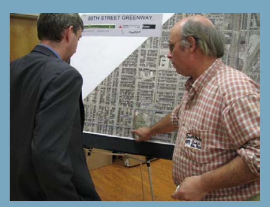
The public offered feedback on the 58th Street Greenway during a series of community meetings.

Project Overview: SRDC was awarded a planning grant to investigate a pedestrian crossing of the Schuylkill River at or near Grays Ferry Avenue. Such a crossing would connect Southwest Philadelphia residents with the many recreational opportunities of Fairmount Park and bring historic Bartram's Garden within reach of the many users of the Schuylkill Banks Trail system. SRDC feasibility study focused on the possibility of utilizing an abandoned railroad swing bridge just south