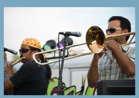
Musicians perform during the summer concert series at Penn Treaty Park.

Project Overview: PHS was awarded a grant to establish spring and fall festivals at Penn Treaty Park. The festivals are designed to celebrate the cultural life of the Fishtown community and reconnect neighborhood residents to the river through a range of educational and recreational activities. The spring festival, Shad Fest, has taken place in late April 2009 and 2010 during the time when shad traditionally swim up river from the ocean to lay their eggs. The fall-themed River City Festival has taken place in October the last two years. Both festivals have included a mix of recreation, music, food, art, and educational activities supported by local businesses, artists, and community organizations.