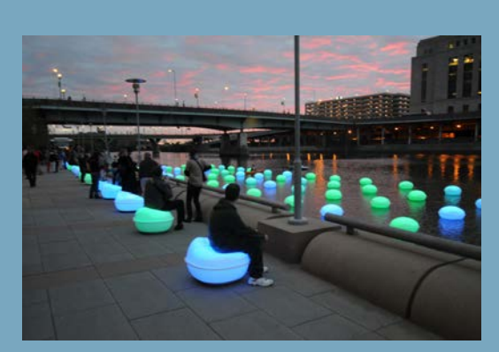
Visitors interact with the Light Drift installation in October 2010.