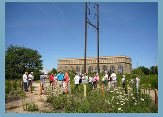
Visitors tour a portion of Lardner's Point Park.