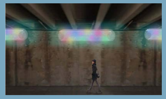
Early rendering of lighting treatment for the I-95 underpass as part of the Spring Garden Greenway project.