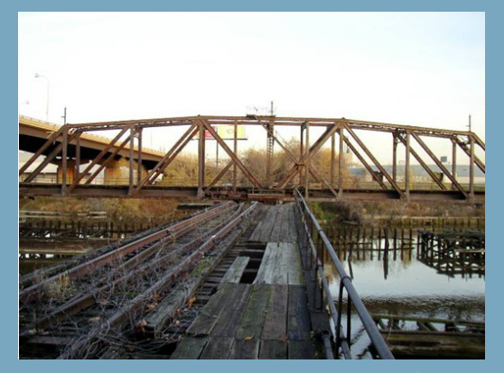
This railroad swing bridge was evaluated for its potential to serve as a pedestrian bridge across the Schuylkill River.