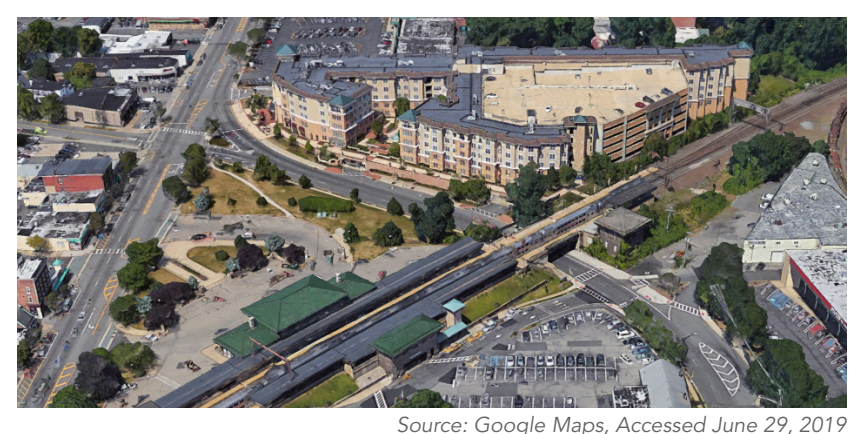
The Highlands at Morristown Station is an apartment complex and parking structure that was developed on the site of a surface parking lot owned by NJ TRANSIT.

The greatest benefit from NJ TRANSIT's perspective is the additional commuter parking. NJ TRANSIT increased commuter parking by nearly 40 percent through the project. The additional parking and new apartments adjacent to the station have substantially increased ridership. NJ TRANSIT also received a financial benefit because the additional parking came at little cost to the agency.