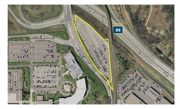
Many of the TOD opportunity sites identified by Metro Transit are park-and-ride facilities such as this one located in Snelling, MN.

MetroTransit posts a list, map, and aerial images of 20 TOD priority sites on its TOD Developer Tools and Resources website: <u>www.metrotransit.org/toddeveloper-tools-and-resources</u>. Publishing this list is designed to generate interest from municipalities and developers about joint development opportunities. Metro Transit also seeks to drive developer interest in other agency-owned land by maintaining an interactive ArcGIS Online tool that identifies all publicly-owned land along active and pending transitways in the region.