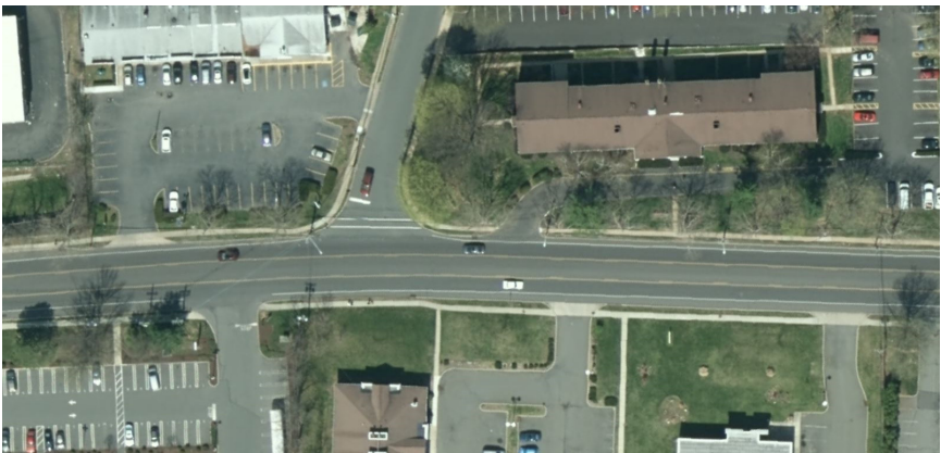
Figure 6: Parkside Avenue AFTER Road Diet, Ewing, New Jersey. Source: Pictometry International. April 2015. Licensed to DVRPC and Mercer County, New Jersey.