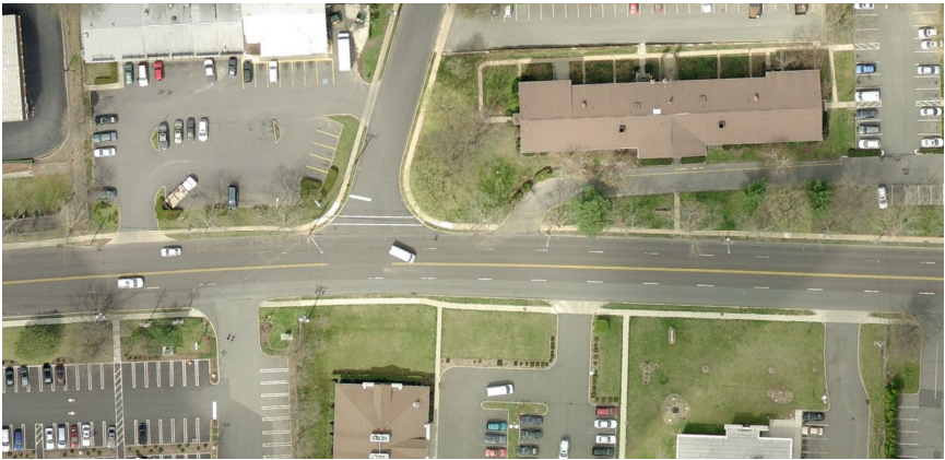
Figure 5: Parkside Avenue BEFORE Road Diet, Ewing, New Jersey.