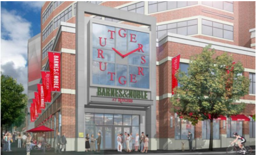
Figure 2: The promenade and Rutgers bookstore at Gateway Transit Village, New Brunswick, New Jersey.

New Brunswick: www.njfuture.org/smart-growth-101/smart-growth-awards/2012-smart-growth-award-winner/2012-sga-gateway-transit-village