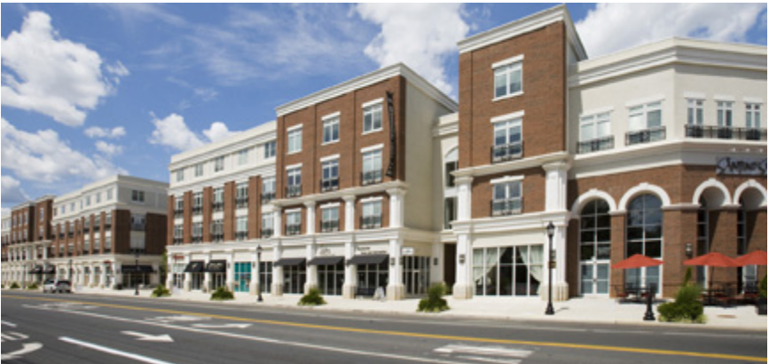
Figure 3: Washington Town Center redevelopment, Robbinsville, New Jersey.

Robbinsville: www.centraljersey.com/archives/robbinsville-state-oks-redevelopment-designation-for-town-center-south/article_5a80fd94-5cdd-5bbe-9c88-7b410398a4ab.html