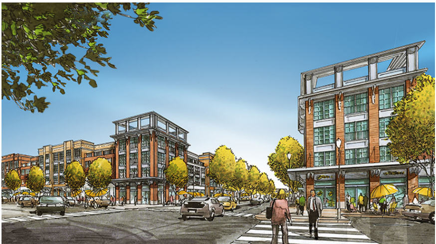
Figure 1: Parkway Town Center, Ewing, New Jersey.

Modify your zoning to permit vibrant, compact, walkable, mixed-use, storefront-style development. Examples include allowing housing over retail or office space, accessory apartments, artist housing, and sidewalk cafes. Housing in these types of mixed-use developments has become a much-desired lifestyle in urban and suburban areas as well. A related approach focusing development around a train station or bus stop is known as Transit-Oriented Development (TOD). This type of development reduces dependence on the automobile.